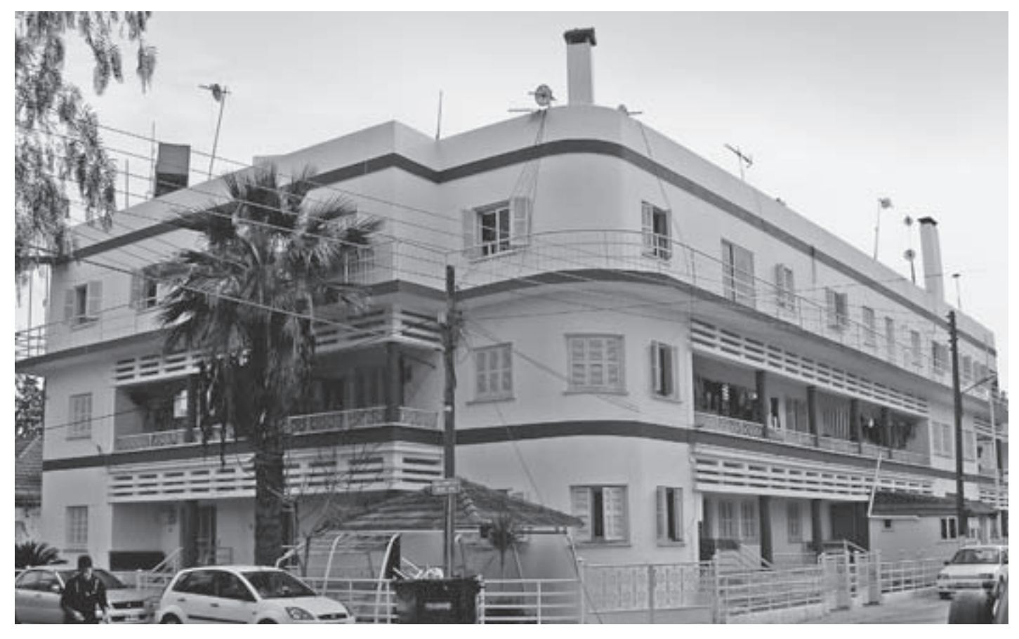
Fig. 1 Residential building without premises, c. 1950s to 1960s, Nicosia (Lefkoşa), new town of the city centre, Erdoğan Rifat street Sl. 1. Stambena zgrada bez lokala, od 1950-ih do 1960-ih, Nicosia (Lefkoşa), novi dio centra grada, Ulica Erdoğan Rifat