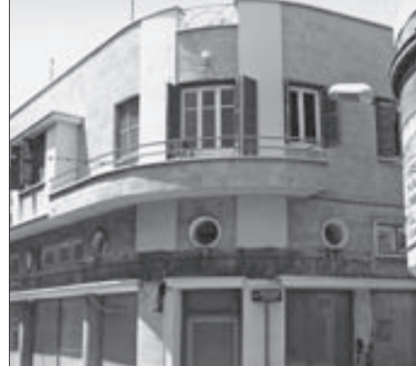
Fig. 4 Detached one-family house, c. 1930s to 1940s, Larnaca, city centre, close to harbour, Georgiou Seferi street

Seven representants of this building type have been catalogued. A three-storey, L-shaped, smoothly plastered building – which is in very bad shape – is located in the center of Kyrenia's new town (Fig. 2). Its two wings end up in a rounded "bow". Apart from the portico which points to the street, that belongs to the local building traditon, the building exhibits a modern architectural language, which will be called "Mendelsohnian" in this study, although that means a slight generalisation: It is based on the rounded ending of the two wings and the decorative-expressive horizontal, band-like character which is emphasized by the window frames and the roof terrace. Rounded and curvilinear corners are typical for Mendelsohn's design language which he uses very rarely and unintrusively on private buildings, but abundantly on buildings with a commercial function. How much it belongs generally to his vocabulary is evident in a comment he made about an apartment building with the same curvilinear corners and balconies in Tel Aviv, designed by Ben Ami