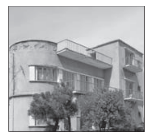
Fig. 2 Detached one-family house, c. 1930s to 1940s, Kyrenia (Girne), city centre, close to Dome Hotel, Ersin Aydin Sokak street

Sl.2. Slobodnostojeća jednoobiteljska kuća, od 1930-ih do 1940-ih god., Kyrenia (Girne), centar grada, u blizini hotela Dome, Ulica Ersin Aydin