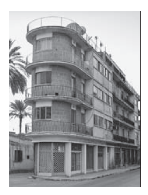
Fig. 6 Block-edge residential building with premises, c. from 1940s and before 1960, Nicosia (Lefkoşa), old town (walled city), Istamboul Caddesi

Sl. 6. Stambena zgrada u bloku s lokalima, oko 1940-ih i prije 1960. god., Nicosia (Lefkoşa), stari grad (utvrda), Ulica Istamboul