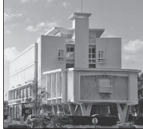
Fig. 13 Public school (now Lefkoşa Atatürk Ilkokulu), c. 1940s to early 1950s, Nicosia (Lefkoşa), old town (walled city), Fuzuli street

The detached one-family houses did not communicate the Central-European utopian society of the 1920s (Fig. 2-4). Neither did the the villas of Le Corbusier and other avant-gardearchitects, as this type of building did not represent the new form of communal living, for which the passenger steamer was the metaphor. It is a revealing fact, that neither Gropius, Scharoun nor May used ship motifs ostentatiously on detached houses.57 For Le Corbusier villas served as a laboratory and experimental field for a new urban design. Therefore, the formal-aesthetical connections of the villas with the topic "ship" would have had a certain societal value, too.58 The early examples of the Cypriot Moderne, however, relate in a rather general, "Mendelsohnian" way to the ship as the moving machine.59 The ship motifs of the - towards the sea oriented - building in Larnaca mean obviously just a "house at the seaside", as it was