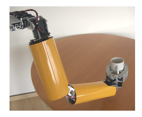
Fig. 3. 7 DOF human-scale anthropomorphic arm with 2 DOF gripper.

On the sensorimotor layer , data is acquired from the sensors and position targets are generated and sent to the