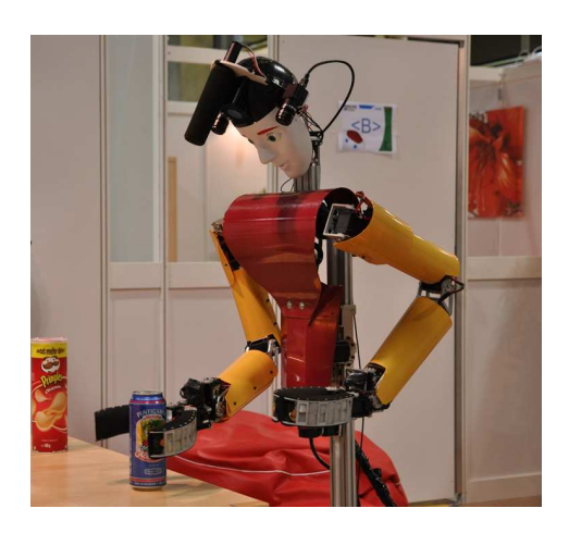
Fig. 1. Our anthropomorphic service robot Dynamaid fetching a drink.

arms that can handle the payload of common household objects. To detect and recognize such objects the robot needs appropriate sensors like laser range finders and cameras. Intuitive communication with the users requires the combination of multiple modalities, such as speech, gestures, mimics, and body language.