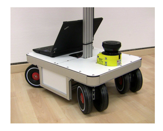
Fig. 2. Omnidirectional base with four individually steerable diff-drives.

Dynamaid's mobile base (see Fig. 2) consists of four individually steerable differential drives, which are attached to corners of an rectangular chassis with size 60×42cm. We constructed the chassis from light-weight aluminum sections. Each pair of wheels is connected to the chassis with a Robotis Dynamixel RX-64 actuator, which can measure the heading angle, and which is also used to control the steering angle. Both wheels of a wheel pair are driven individually by Dynamixel EX-106 actuators. The Dynamixel intelligent actuators communicate bidirectioanly via an RS-485 serial bus with an Atmel Atmega128 microcontroller at 1 Mbps baudrate. Via this bus, the control parameters of the actuators can be configured. The actuators report back position, speed, load, temperature, etc. The microcontroller controls the speed of the EX-106 actuators and smoothly aligns the differential drives to target orientations at a rate of about 100Hz. The main computer, a Lenovo X200 ThinkPad notebook, communicates over