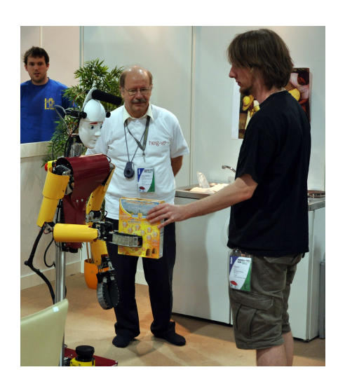
Fig. 7. Dynamaid delivers a cereal box during the Supermarket test at RoboCup 2009 in Graz.

object through global navigation. Then, it uses vertical object detection to determine distance to and height of the horizontal surface to manipulate on. With its torso lifting actuator, it adjusts the height of the torso such that the trunk LRF measures objects shortly above the surface in the horizontal scan plane. It approaches the table as close as possible through safe local navigation. Next, it detects the object to manipulate in the horizontal plane. If necessary it aligns to the object in sidewards direction using safe local navigation again. Finally, it performs a motion primitive to grasp the object at the perceived location.