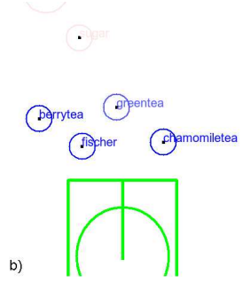
Fig. 5. Object Recognition: a) the camera image with rectangular object regions that are computed from LRF object detections. The image also shows extracted SURF features (yellow dots) and recognized object class. b) recognized objects are tracked in egocentric coordinates by a Kalman filter.