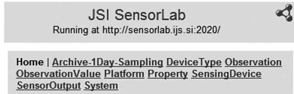
Figure 5. Web Interface of the D2R Server presenting all the classes used in mapping

For the content related to sensor observations the unique ids from the database were used to identify all the individuals corresponding to Observation , SensorOutput and ObservationValue . The sensor measurements registered over the last day are mapped one by one, while for the past measurements average of the last hour is calculated in a separate view of the database and then mapped to RDF representation.