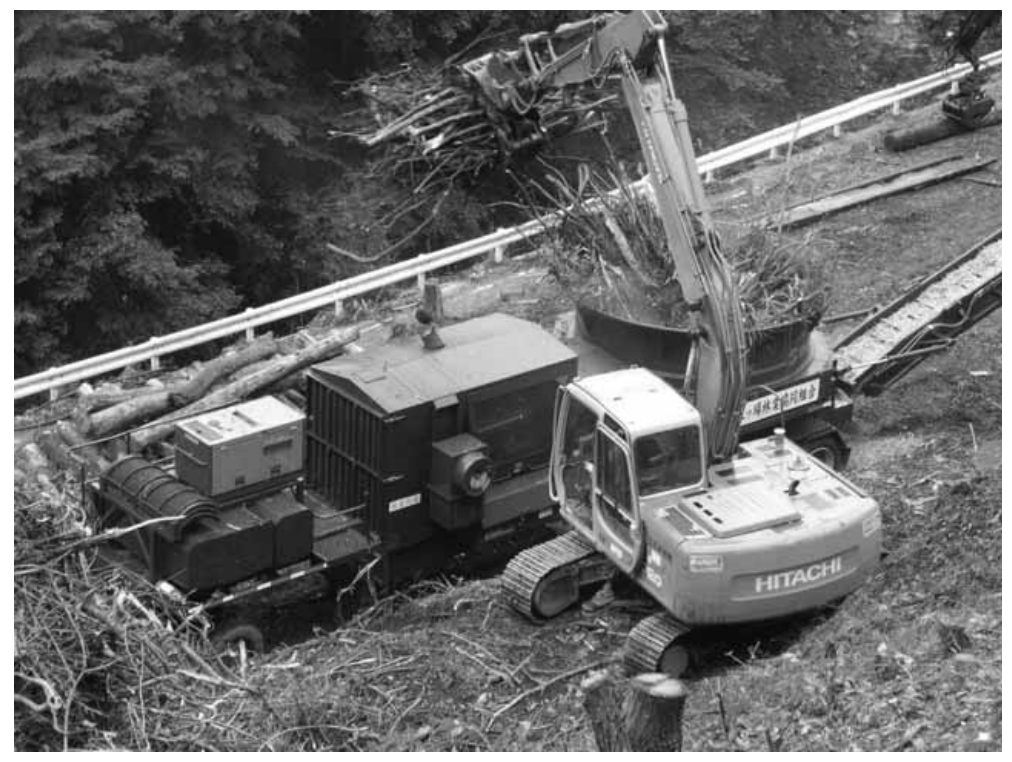
Fig. 2 Grapple loader Slika 2. Utovarivač s hvatalom