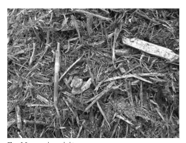
Fig. 4 Processed wood chips Slika 4. Izrađena drvna sječka

Although the moisture content of logging residues to be comminuted and the screen size opening of a tub grinder would influence the productivity of the tub grinder, only one instance (120.4% of mois-