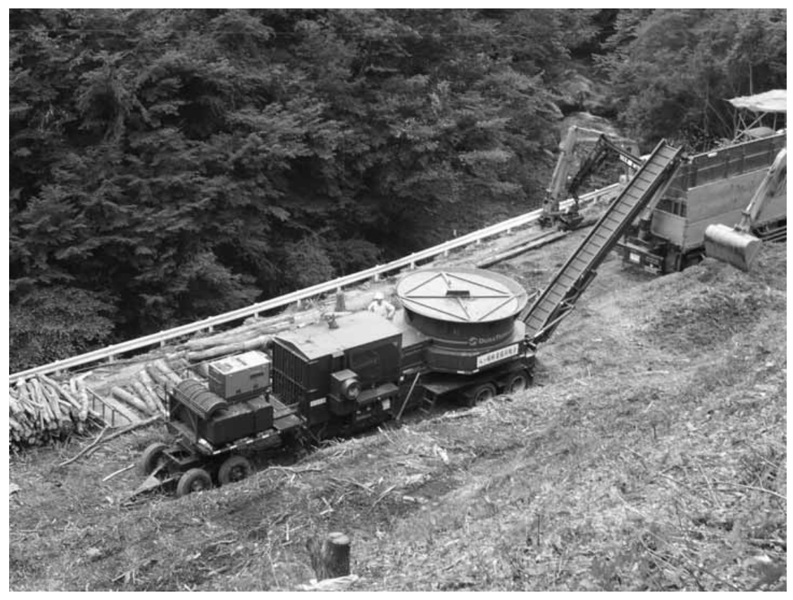
Fig. 1 Tub grinder Slika 1. Bubnjasti iverač

for the purpose of loading wood chips) loaded wood chips onto a truck, and a truck transported the wood chips. Therefore, these two loaders were regarded as auxiliary machines for the tub grinder in this system. The tub grinder was equipped with a conveyor to take wood chips directly into a truck. However, a bucket loader for loading chips was introduced because interest was focused on the truck mobility. Time studies were conducted of the tub grinder and two loaders, and the volume of the processed chips and fuel (light oil) consumption of each machine was measured. A bin (0.60 meters long, 0.50 m wide, 0.60 m high, and 3.6 kg weight) was filled with chips, and the weight of the bin was also measured (scales: MODEL DS-261, Teraokaseiko Co., Ltd., Japan). Consequently, the green weight of the chips per unit volume could be calculated. In order to define the moisture content of the chips, ten chip samples were taken. The green mass of each sample was measured, and the samples were then dried at 103 degrees Celsius for more than 24 hours. The moisture content was determined by dividing the mass of water contained within the sample by the dry mass of the sample.