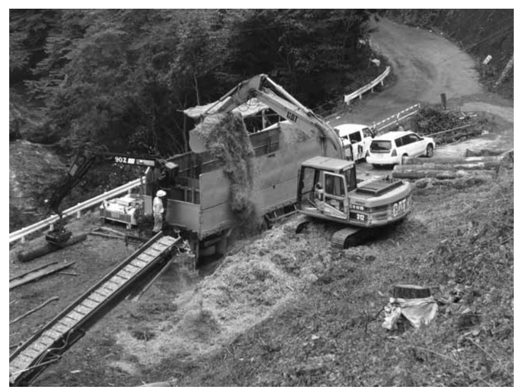
Fig. 3 Buchet loader Slika 3. Utovarivač s korpom