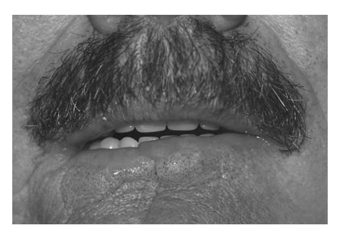
Fig. 6. Final prosthesis in mouth.

One of the studies reported removal of only 3 out of 169 implants placed into irradiated mandible<sup>8</sup>. Some authors believe that the period from radiotherapy to implant placement, in the absence of hyperbaric oxygen treatment, should be from 13 to 24 months<sup>3</sup>. Another study analyzed the fate of 221 Branemark and IMZ implants placed into irradiated mandible during a 10-year period, and only 18 (8.1%) implants failed to show osseo-