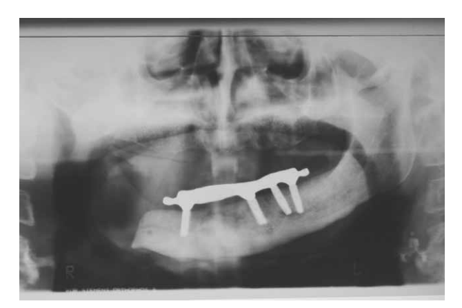
Fig. 1. The panoramic radiograph of implants and screwed bar.

ternal examination and analysis revealed facial asymmetry caused by depression and collapse of the right angle of the mouth as a consequence of the resection, as well as the loss of motor and sensory innervation on the righthand side of the lower lip. Mandible was retruded and