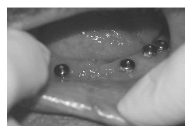
Fig. 2. Healing abutments after three weeks.

shifted towards the operated side, even when the mouth was closed.