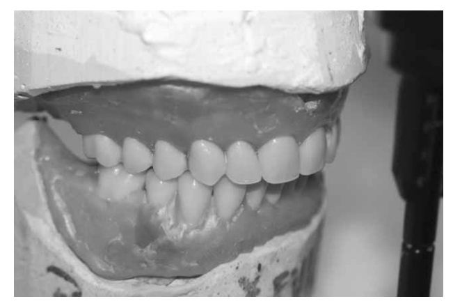
Fig. 3. Wax up in articulator.

Patient was followed-up for the first seven days, one month and 6 months for the possible irritations, decubital lesions, and oral hygiene. Upper total denture instability presented a major problem, followed by lower denture saddle deviation on the operated side due to inexistent continuity of the mandible. One year after the completed