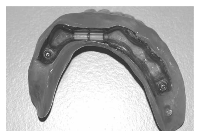
Fig. 4. Metal housing with retention parts.