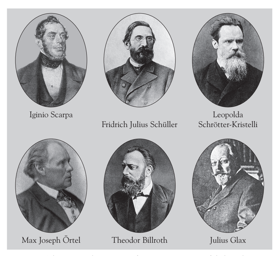
Figure 2 Advocates and promoters of Opatija as a centre of thalassotherapy Slika 2. Promotori Opatije kao talasoterapijskog centra

Physical Medicine" of the School of Medicine of the University of Rijeka in 2006. These achievements were recognised by two awards of the Town of Opatija, and set track for an ambitious development of Thalassotherapia toward the regional leadership in health tourism, and later maybe even in medical education and legislation.