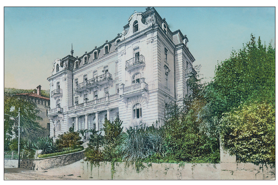
Hotel Speranza, danas Villa Dubrava, dio opatijske Thalassotherapije Former Hotel Speranza, now Hotel Villa Dubrava of the Thalassotherapia complex