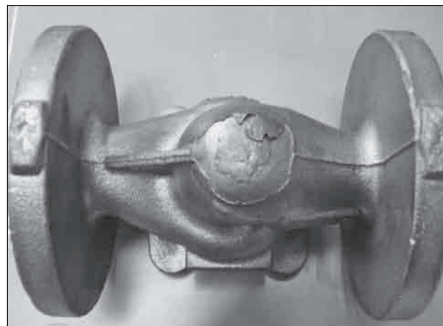
Figure 2 Defects associated with too high LC content in moulding sand

The ability to create a surrounding layer on the grain surface is attributed to carbonaceous additives. Layer surrounding improves moulding sand fluidity and decreases casting surface roughness.