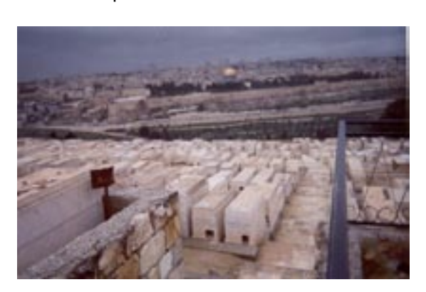
Figure 3. Old Jewish cemetery in Jerusalem

As Editor-in-Chief of ADC, I was very satisfied with the contacts made with the Israeli dermatovenereologists and some presenters who expressed their wish to publish in ADC.