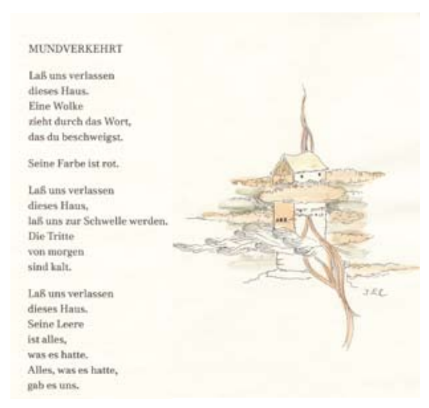
Ilustrations of M. Rupec's poems by famous Croatian naïve painter Ivan Lacković Croata