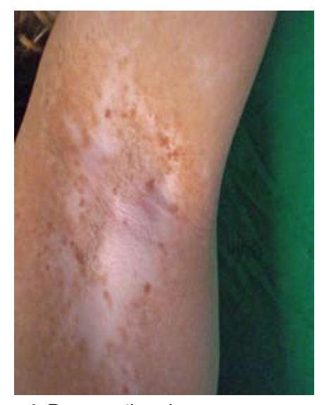
Figure 4. Preoperative view.

Surgical treatment options for vitiligo offer the potential for rapid and more desirable amounts of repigmentation. The different modalities of surgical techniques include tattooing, organ-cultured fetal skin allografting, epidermal culture grafting, melanocyte culture grafting, autologous noncultured melanocyte-keratinocyte cell transplantation, epidermal grafting by the suction blister technique, thin Thiersch split skin grafting, or miniature punch grafting. Treatment of vitiligo is very complex. It is