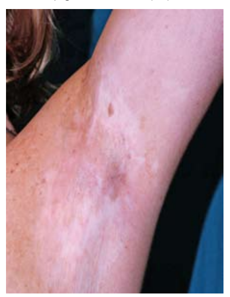
Figure 5. Postoperative view at 2 years without sun exposure.

Since 1987, there have been many reports on transplantation of cultured autologous melanocytes (9,10). As it involves in vitro multiplication of cells, the use of various culture media is obligatory. Culture techniques require a state-of-the-art laboratory, highly trained staff and at least two visits by the patient, and are quite expensive. As such, they are restricted to very specialized centers and are mainly useful for research purposes. Subsequently, the culture technique was modified by eliminating the step of in vitro culture of melanocytes, and cells were transplanted directly onto the affected depigmented area (11). The use of the