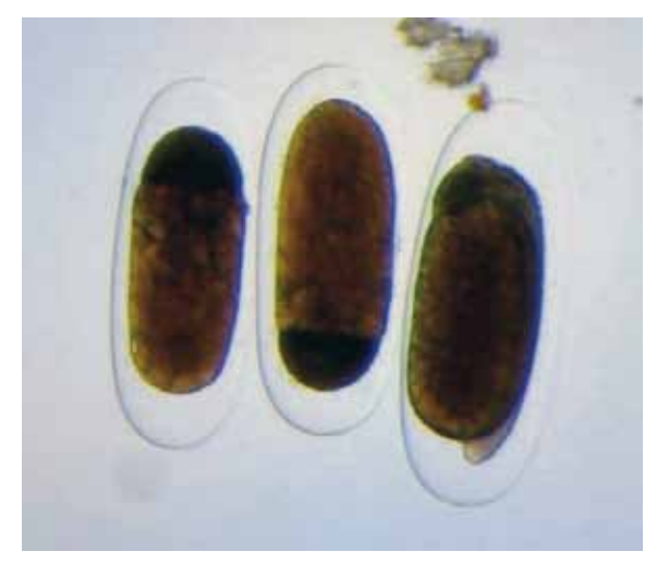
Fig. 2. Anchovy eggs found on December 7th, 2006