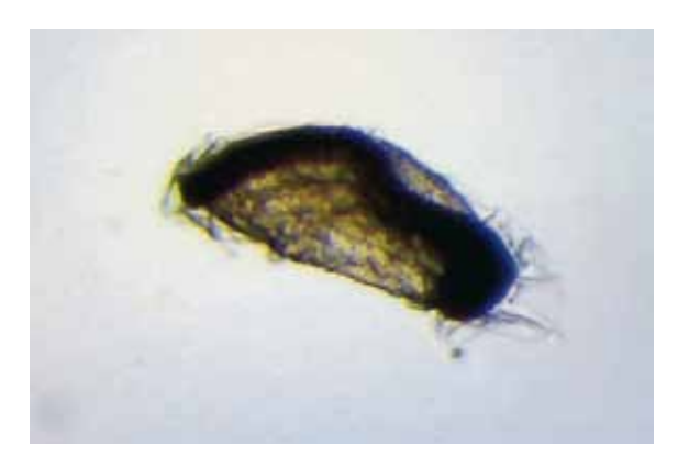
Fig. 3. Anchovy egg with destroyed chorion

velopment, and the third egg was at the end of the VI stage. The chorion of the fourth egg was destroyed, probably by the plankton net during sampling (Fig. 2 and 3). The major axes of eggs were 1.19, 1.19 and 1.33 mm, respectively.