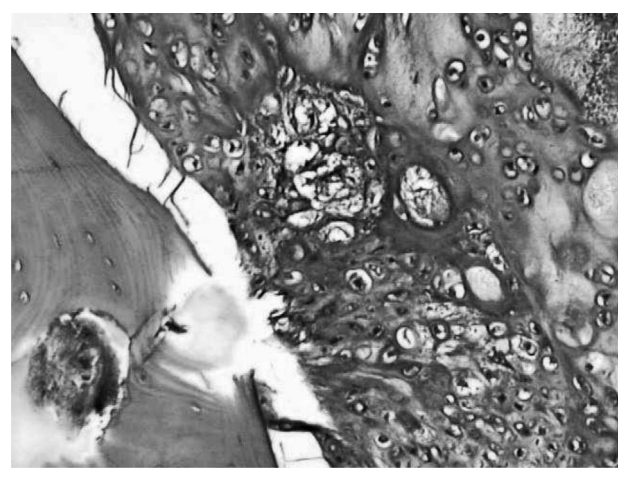
Fig. 2. Tumor biopsy specimen shows chondrosarcoma grade II that is infiltrating the bone and expanding to neighbor soft tissue.

eral pneumonia. Fiber optic bronchoscopy demonstrated only vellow secretion in tracheobronchal system. Microbiological, mycological and cytological findings of the specimens obtained by bronchial washing were negative. Mycobacteria Growth Indicator Tube test was negative. All the hemocultures were negative too, the serological tests on respiratory viruses and HIV as well. The radiography of the right shoulder showed no local abnormalities after surgery. On the initial combined antimicrobial therapy the patient did not react. He remained high febrile and developed small pleural effusion. The pleural punction was performed. The cytological finding pointed to the inflammation. Microbiological finding was negative. Control chest radiography showed bilateral pneumonia-like infiltrates (Figure 3) and CT showed progression of the disease and few nodular infiltrates were observed pointing to possible metastasis process (Figure 4). CT guided transthoracal punction was performed cytological finding was typical for inflammation. Despite changed antimicrobial therapy clinical worsening occurred and the patient died two weeks later. The autopsy showed multiple metastases of the lung with multiple small thromboemboli of the lung by tumor cells.