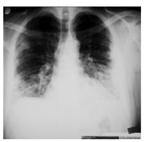
Fig. 3. Chest radiograph shows bilateral pneumonia like patchy consolidations.

eral pneumonia. Fiber optic bronchoscopy demonstrated only vellow secretion in tracheobronchal system. Microbiological, mycological and cytological findings of the specimens obtained by bronchial washing were negative. Mycobacteria Growth Indicator Tube test was negative. All the hemocultures were negative too, the serological tests on respiratory viruses and HIV as well. The radiography of the right shoulder showed no local abnormalities after surgery. On the initial combined antimicrobial therapy the patient did not react. He remained high febrile and developed small pleural effusion. The pleural punction was performed. The cytological finding pointed to the inflammation. Microbiological finding was negative. Control chest radiography showed bilateral pneumonia-like infiltrates (Figure 3) and CT showed progression of the disease and few nodular infiltrates were observed pointing to possible metastasis process (Figure 4). CT guided transthoracal punction was performed cytological finding was typical for inflammation. Despite changed antimicrobial therapy clinical worsening occurred and the patient died two weeks later. The autopsy showed multiple metastases of the lung with multiple small thromboemboli of the lung by tumor cells.