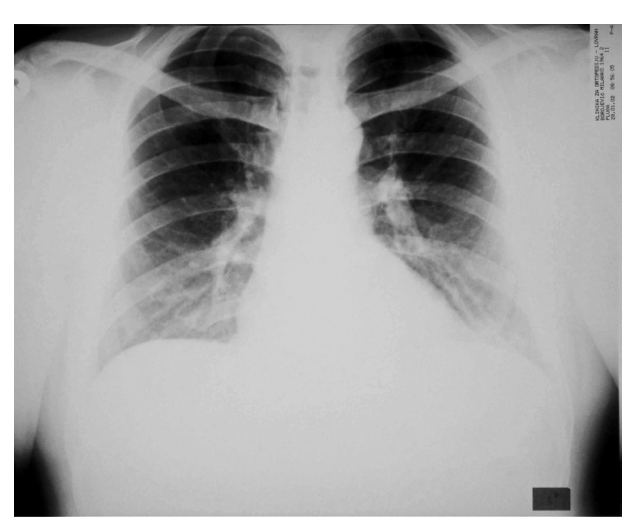
Fig. 1. Chest radiograph before surgery appears normal.

chest radiography at this time were normal (Figure 1). After that the patient underwent surgery - the tumor was extirpated, arthrodesis of the right humeroscapular joint and spongioplastic of the humerus with homotransplantations was made. Postoperative patohystological diagnosis was CS grade II (Figure 2). Two weeks after the surgery the patient become high febrile with productive cough and dyspnea. The laboratory analysis showed lekocytosis of 11.3 \times 10^9/L (normal range = NR 4–9 × 10<sup>9</sup>/L), elevated sedimentation rate 115 (NR 2-10 mm/h), C reactive protein 150 mg/L (NR<5), alkaline phosphatase 204 (NR 3-104 U/L), gamaglutamyltransferase 171 (NR 7-32 U/L), aspartataminotransferase 48 (NR 6-35 U/L), alaninaminotransferase 119 (NR 6-35 U/L), fibrinogen 9.6~(NR~1-3.5~mmol/L) and D-dimer 527~(NR<192~mg/L). All other biochemical and hematological findings were within normal limits. Chest radiography showed bilateral infiltrates of the lung pointing to pneumonia. The patient was transferred to the department of pulmology. Computer tomography (CT) of the chest confirmed bilat-