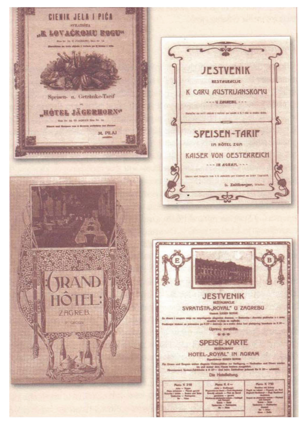
Picture 4. Examples of bilingual menus (I. Sabotič: Stare zagrebačke kavane i krčme, 2007.)