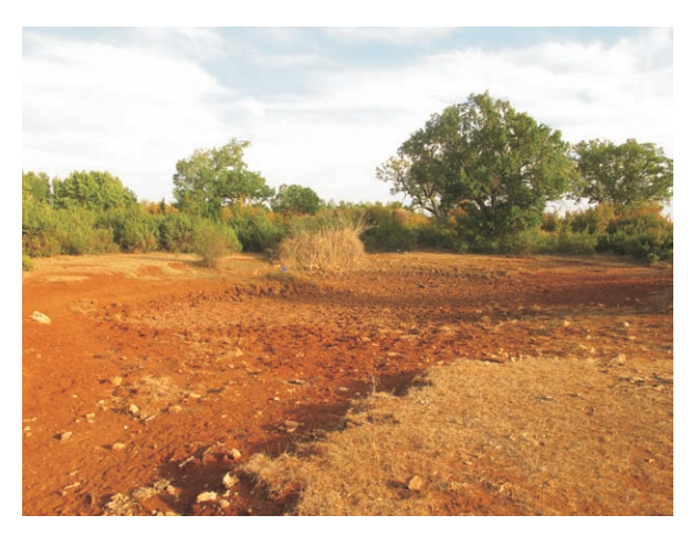
Fig. 6. Bunari Pond – new locality of Damasonium polyspermum Coss. in September

especially the species Paspalum paspalodes (Michx.) Scribn. (BORŠIĆ et al. , 2008), which spreads aggressively around some other investigated ponds in this area.