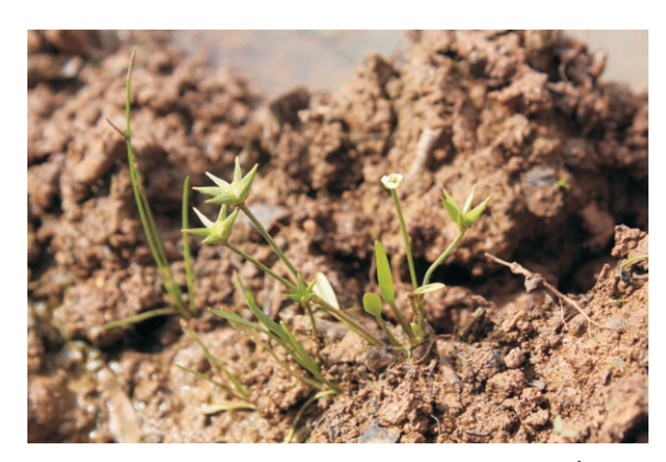
Fig. 3. Terrestrial form of Damasonium polyspermum Coss., on 14<sup>th</sup> June 2012