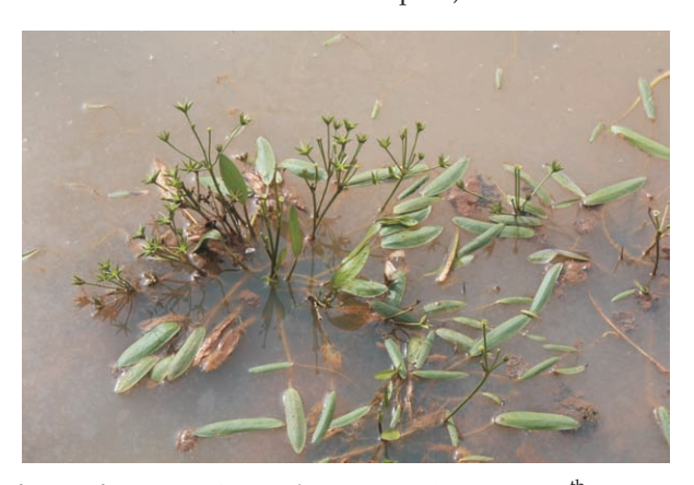
Fig. 2. Aquatic form of Damasonium polyspermum Coss., on 14<sup>th</sup> June 2012