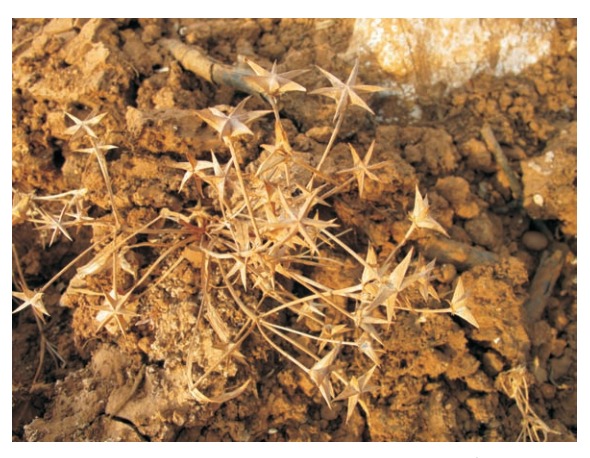
Fig. 4. Dry specimen of Damasonium polyspermum Coss., on 8<sup>th</sup> September 2011

only few localities further to the east (Greece, Sicily and Libya), while D. bourgaei is more widespread around the Mediterranean, extending eastwards to India. D. alisma is the most northerly taxon, occurring mostly in England and France, with few localities in Portugal, Italy, Russia and Ukraine (RICH & NICHOLLS-VUILLE, 2001).