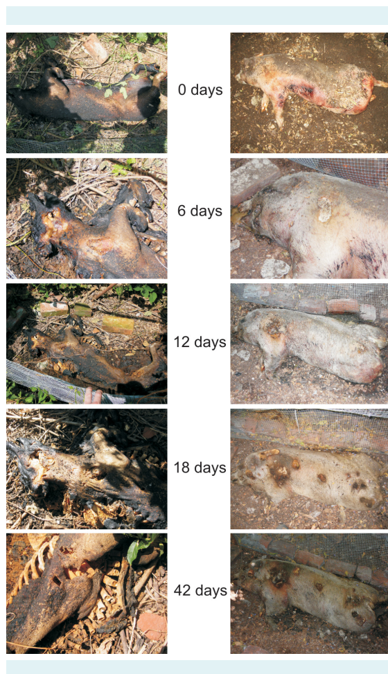
FIGURE 1. Experiment performed during the winter: stages of decomposition of the burnt (left) and the control (right) pigs.

pes (Sphaeroceridae), Themira sp, Sepsis sp (Sepsidae), Gen. spp (Sciariidae)] and Coleoptera (Staphylinidae, mainly Crochophilus maxillosus ) was recorded. At the same time, a clear reduction of the tissues in several body regions (head, thorax, and abdomen) was observed. On the day 26, the carrion appeared completely skeletonized, with complete bone disarticulation. The maggot activity ( C. vomitoria , Calliphora vicina , Phormia regina , Hydrotaea capensis ) was localized only on the soil and under a few skin fragments, whereas Coleoptera (Silphidae, Staphylinidae, Carabidae, Anthicidae) were widely spread on all the body remains. There was no presence of larvae from the sixth week after exposure (day 42 and the following days). Two months after the exposure (day 60), the bones were clean and only a few remains of burnt skin and muscles were still present. Larvae and adults of coleopterans belonging to different families (Staphylinidae, Carabidae, Trogidae, and Aphodidae) were still recovered.