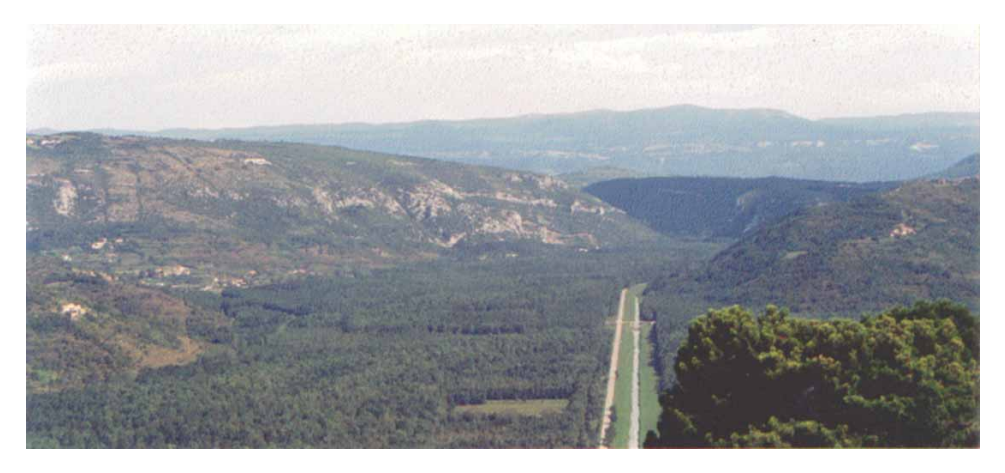
Fig. 1. Photo of investigated area (fluvial plain of River Mirna).

Motovun Forest is located at 10–13 m a.s.l. and covers a 25-km long and 1–1.5-km wide area in the fluvial plain of the Mirna River – which flows into the Adriatic Sea to the south of Novigrad – and the Butoniga River. The Motovun area is characterized by hills 300 to 400-m-high with slope gradients ranging from 5 % to 65 %. The hilly landscape was created by the outcrop of the sedimentary sequence of a Triassic-Eocene carbonatic platform and Eocene-Oligocene Flysch turbidites. The erodibility of Flysch sediments and the slope gradient are responsible for the large production of fine sediments that floods concentrate in the valley bottom, thus creating very thick, scarcely differentiated alluvial deposits. Because of the continuous erosion of mineral particles from the slopes and their deposition in the valley bottoms, the soils of the Motovun area are scarcely developed. According to the soil map of Croatia – Pazin 1 sheet (VIDAČEK et al. , 1978) – the most wide-spread soil units of the Motovun area are the AG-HG unit in the valley bottom, and