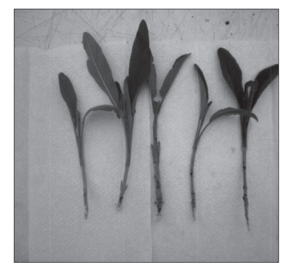
Figure 2. Sage cutting Slika 2. Reznica kadulje

Afterwards, plant cuttings were treated with the rooting powder Rhizopon I® containing rooting powder auxin IBA (indol-butyric acid 0,5%) (variant A2) and planted in substrate or cuttings were planted in substrate without being treated with rooting powder (variant A1). Plants were planted at the beginning of April in 9 cm diameter plastic pots filled with commercial substrate Fruhstorfer Erde - Aussaat und Stecklingserde (Hawita EU, Deutschland). Plants were irrigated regularly by hand depending on weather conditions and development stage of plants. The average daily air temperature during rooting period of the investigated plants ranged from