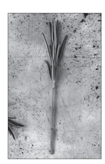
Figure 1. Rosmary cutting Slika 1. Reznica ružmarina