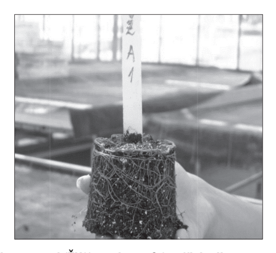
Figure 4. Root development of treated with hormone (ŽA2) and untreated (ŽK2) cuttings of S. officinalis

Slika 4. Usporedba razvijenosti korijena tretiranih renica (ŽA2) S. officinalis s hormonom i netretiranih (ŽK2)