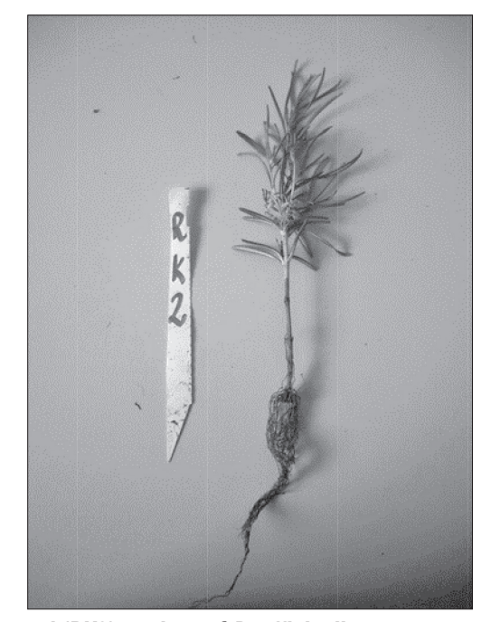
Figure 3. Development of treated with hormone (RA2) and untreated (RK2) cuttings of R. officinalis

Slika 3. Razvoj tretiranih renica (RA2) R. officinalis s hormonom i netretiranih (RK2)