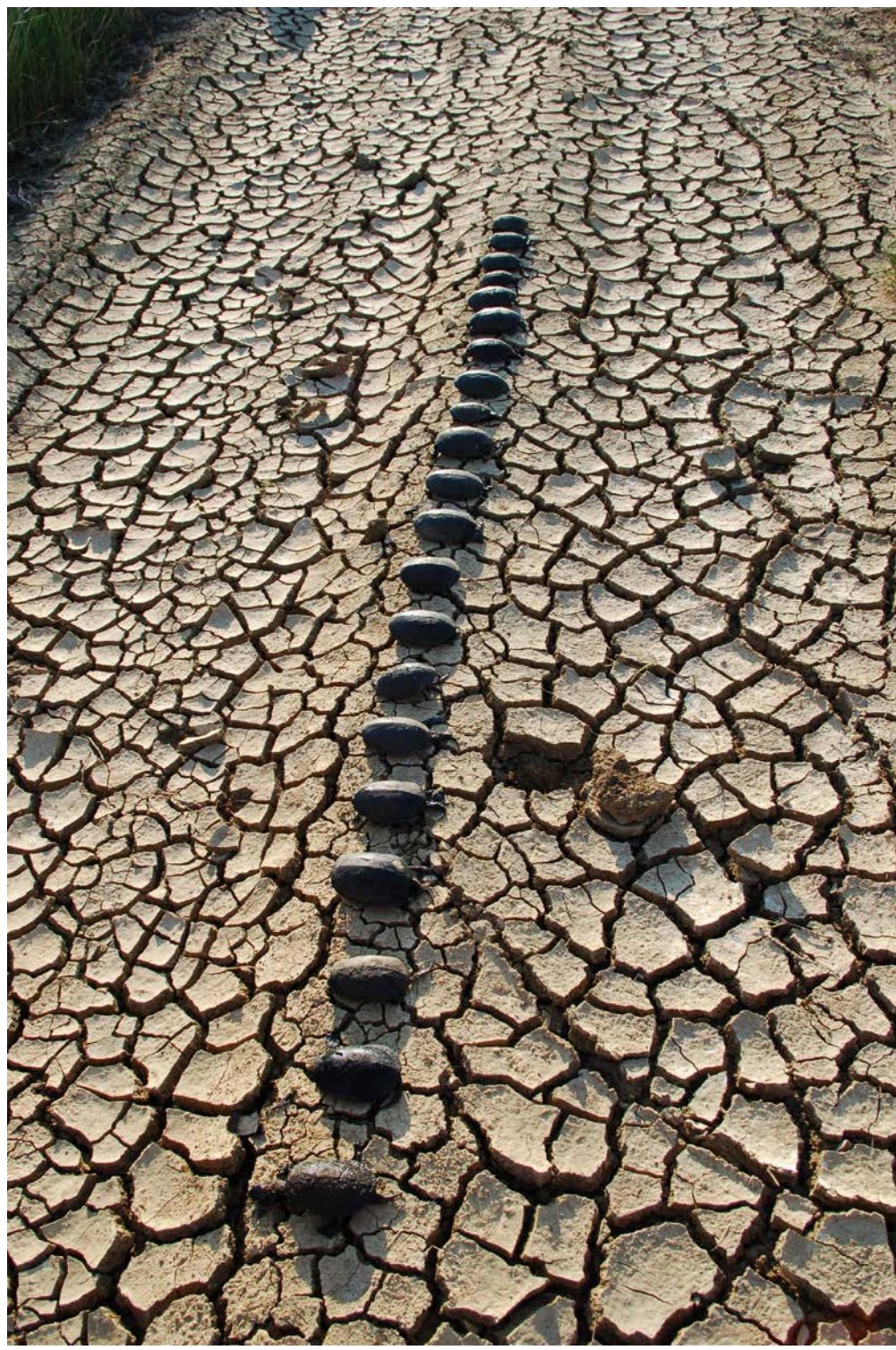
Figure 2. At Kolansko blato on the island Pag (Croatia) we found a fish trap with 21 dead Emys orbicularis inside.

Slika 2. Na lokalitetu Kolanjsko blato na otoku Pagu (Hrvatska) pronašli smo vršu sa 21 mrtvih jedinki vrste Emys orbicularis.