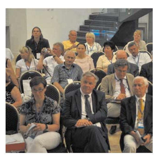
The 53<sup>rd</sup> INPC opening ceremony.

plied Research Group on the Delivery of Neurology Services, International Interdisciplinary Medicine Association, European Psychiatric Association, and Central and Eastern European Stroke Society. For the first time, this year's Congress was endorsed by WFN. The main sponsors of the Congress were the Ministry of Science, Education and Sports of the Republic of Croatia, the City of Graz and the City of Zagreb. This year's Congress was attended by more than 350 participants from Croatia, Austria, Bosnia and Herzegovina, Montenegro, Czech Republic, Italy, Hungary, Macedonia, Germany, Poland, Romania, Russia, the United States, Serbia, Slovenia, Spain, Sweden, Switzerland, Turkey, Ukraine, Great Britain, Lithuania, Thailand, Australia, New Zealand, India, South Korea, and many more.