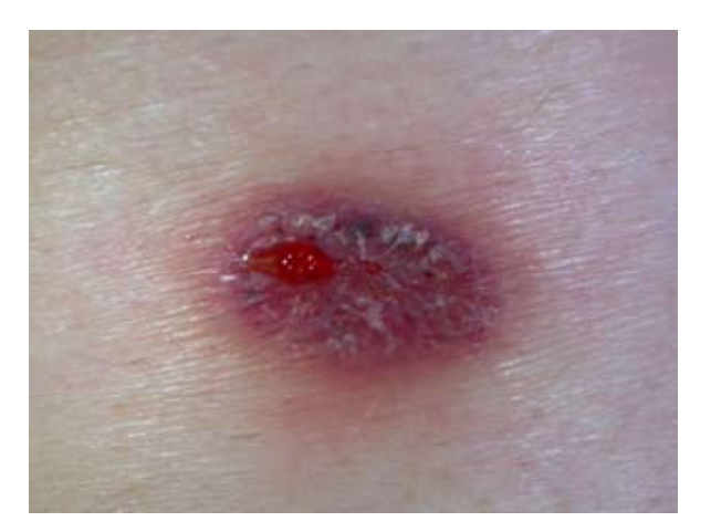
Figure 1. Erythematous crusted plaque with superficial ulceration, surrounded by purple borders.

a plaque. It gradually increased in size and was surrounded with purple borders, as well as superficial ulceration (Figure 1). Dermoscopy with 20× magnification showed large gray-blue ovoid nests, peripheral linear and irregular vessels, and ulceration, but no pigment network (Figure 2). Laboratory findings were normal; smears and cultures for bacteria and fungi were negative. The lesion was completely ablated, and histological examination showed a florid pseudoepitheliomatous hyperplasia and a characteristic intraepithelial and superficial dermal threelayered granuloma with the inner layer consisting of sterile neutrophil micro-abscess and haemorrhage, surrounded by a granulomatous infiltrate and an outer rim of plasma cells and eosinophils (Figures 3, 4). Granulation tissue was found near to the cutaneus ulceration, and scarring was observed at base of the zoned inflammatory infiltrate. Based on the clinical and histological findings, our case was diagnosed as SGP, a localized vegetative variant of PG. Further tests, including a chest x-ray, full abdomen ultrasound, and fecal occult blood test, were all negative. Her lesion resolved after complete surgical excision, and there has been no relapse so far.