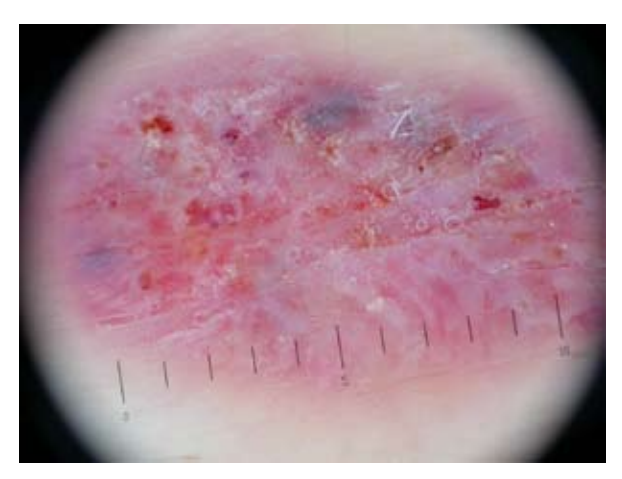
Figure 2. Dermoscopy showed lack of a pigment network, large gray-blue ovoid nests, peripheral linear and irregular vessels, and ulceration (original magnification ×20).

SGP is characterized by sterile abscesses, which form sinuses in the skin surface, as well as vegetative ulcers, mainly at the sites of trauma. It clinically presents with papules, nodules, or plaques, which can discharge pus. The base of the ulcer is clean and granulating, with borders that are not undermined (6). The predilection site is on the trunk: SGP is most frequently found on the back, followed by the hip, arm, and abdomen; only rarely it presents on the face (7). Dermoscopy may lead to the false diagnosis of a basal cell carcinoma (BCC), since the character-