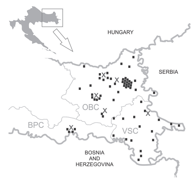
Fig. 1. Study area in east Croatia. OBC – Osijek-Baranya County, VSC Vukovar-Srijem County, BPC – Brod-posavina County, small squares – position of CDC traps, X – place of human case of WNVD.

Mosquitoes were sampled in three northeast Croatian counties (Figure 1). Traps were distributed with an increased attention of sampling in the places of outbreak,