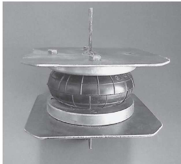
Figure 2 Pneumatic-flexible element with preparation