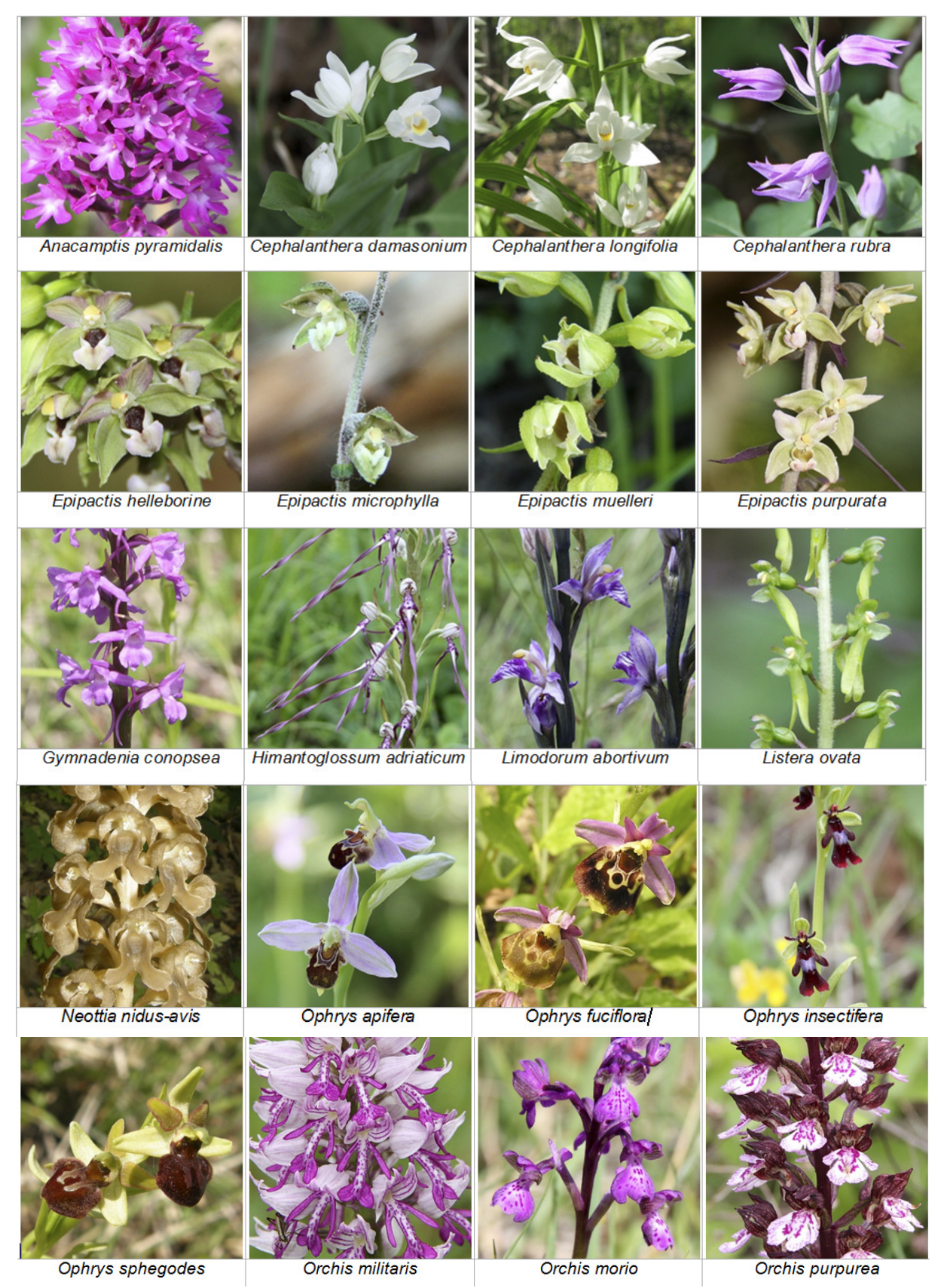
Appendix 1. Photographs of investigated taxa.