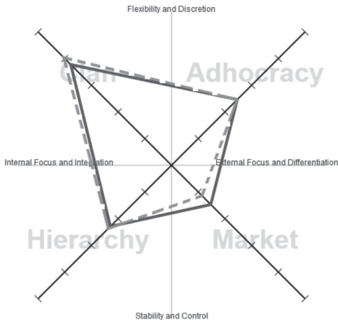
Figure 3. Diagram of differences in organizational culture preferences depending on the gender of the respondents