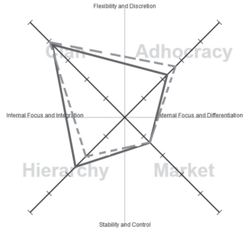
Figure 4. Diagram of differences in organizational culture preferences depending on the desired place of employment

Figure 4 shows the differences and similarities between students who want to work in Croatia (solid line) after their graduation or abroad (dashed line). This category of respondents once again repeats the clan culture domination. Therefore, a “by-product” of this analysis is much more interesting, because it reveals that actually more students want to leave their country and work abroad, rather than find employment in Croatia!