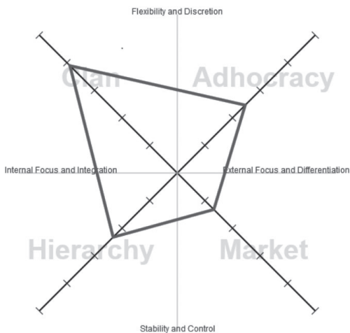
Figure 2. Surveyed students' preferences of the future employer's organizational culture

This means that they aspire to work in a company whose success is primarily the result of employee loyalty, tradition and mutual cooperation of all employees. Interpersonal relationships in companies with the clan organizational culture are based on caring for people (Cameron, 2004; www.ocai-online.com). Because of this, members of the clan culture tolerate the stresses of everyday business more easily, even the low salaries. In the clan culture, employees respect each other: workers see their managers more as mentors and management tends to take into account the opinion of all employees when making business decisions. In such companies, there is an overall atmosphere of mutual respect and support, which is actually the main source of job commitment of employees and their effectiveness. These results are presented in Figure 2 and Table 3.