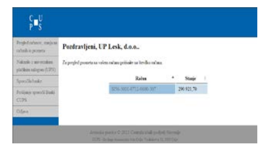
Figure 2: The simulation of online banking for practice firms.