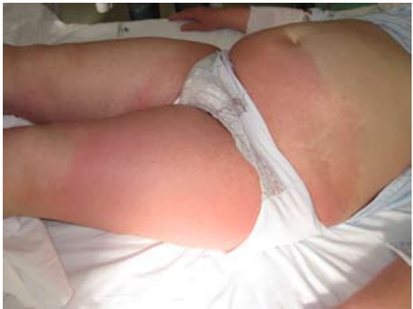
Figure 1a and 1b. Erythematous rash on hips and upper thighs