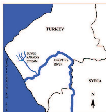
Fig 1. Map of the study area, Büyük Karaçay Stream

with the report about the one exotic species, Gambusia affinis (Baird & Girard, 1853) and three native species, C. barroisi , C. damascina and G. rufa .