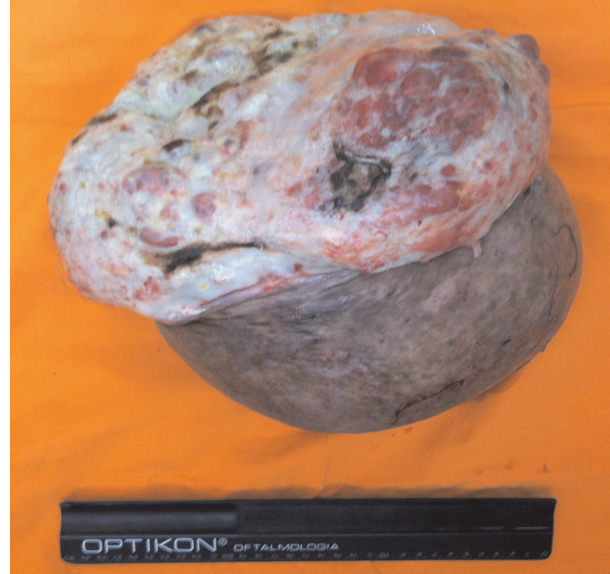
Fig. 2. Aggressive angiomyxoma (after removal).