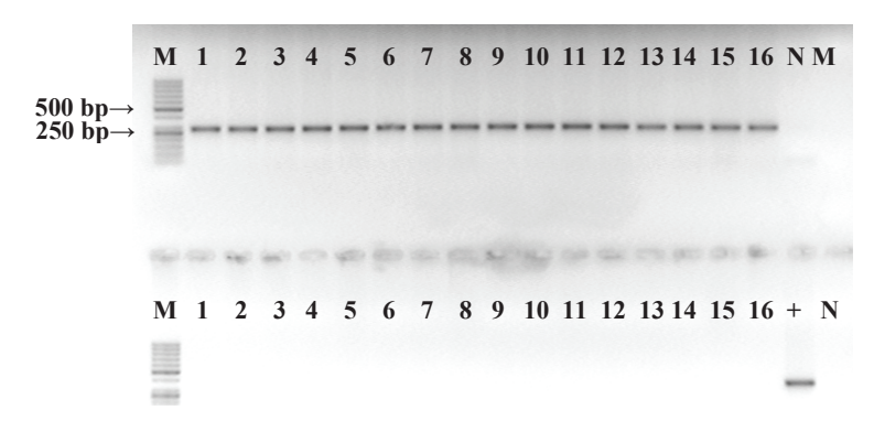
Figure 1. Agarose gel electrophoresis of the labelled PCR products. Upper part shows a single PCR products (283 bp) with labelled primers, lower part shows the PCR products (329 bp) of RYR1 primers. gDNA contamination was not detected. Lanes represents samples 1-16 as defined in the material and methods. +: positive control N: negative control; M: 50 bp ladder (Thermo Fischer Scientific, USA).