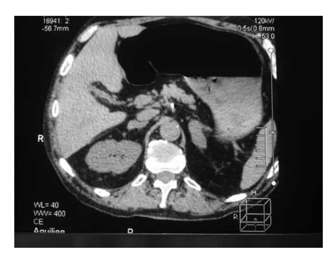
Fig. 1. Abdominal CT scan showing tumor of the left adrenal gland and enlargement of the right adrenal gland. Liver and pancreas appeared normal.

first case report of elevated serum amylase caused by lung carcinoma was published in 1951<sup>2</sup>. Since then, mostly cases of amylase producing tumors described in the literature have been ovarian cancer, pheochromocytoma and multiple myeloma<sup>3</sup>. Elevated serum and urine amylase associated with lung cancer is a rare condition occurring in 1% to 3% of all lung cancer cases<sup>4</sup>. The highest incidence of lung cancer is in male population aged over 65 years. However, amylase producing lung carcinomas are often seen in younger population aged 53 to 58 years<sup>5</sup>. More than 80% of cases are adenocarcinoma associated and very rarely hyperamylasemia is seen in microcellular carcinoma<sup>5</sup>.