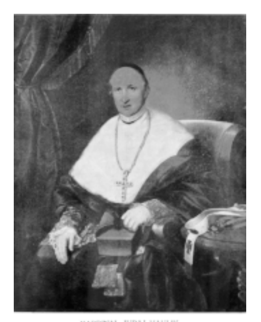
KARDINAL JURAJ HAULIK, PRU ZAGREBAČKI NADDISKOP TEMELJURAJ SANDITANA NEUTANI PELDINDINGA U ZAGREBU.