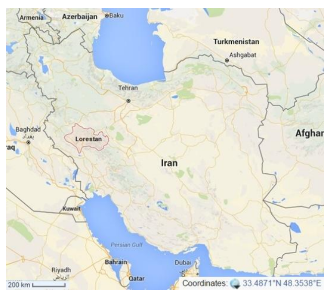
Figure 1. Geographical location of the Lorestan province

Through the advancement of human knowledge, the need for precise and scientific decision making while keeping in mind its sensitive nature, new decision making methods including Multi Attribute Decision Making (MADM) could find a suitable position in mining engineering. A selection of haulage equipment, Mining Method Selection (MMS), coal type ranking, support system selection, loading equipment choice, road header selection, ranking of risks in mines and ventilation assessment using new MADM or statistical methods of risk assessment have replaced traditional methods (Bazzazi et al., 2011; Hekmat et al., 2008; Lashgari et al., 2011; Lashgari et al., 2012; Lashgari et al., 2010; Mikaeil et al., 2009; Yari et al., 2015; Yari et al., 2015; Yari et al., 2013; Yari et al., 2014; Yari et al., 2015; Yarahmadi et al., 2014). Finally, with regard to the above, it is necessary to be able to rank decorative stone mines upon different factors, considering the assessment of dimensional stone mines, and experts in MADM models. In this paper, the TOPSIS (Technique for Order of Preference by Similarity to Ideal Solution) method, which is one of the technical and applicable models of MADM, has been used for evaluating and ranking the alternatives and in the end, the most suitable alternative is selected.