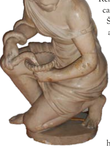
Hygiea, plaster cast.

photographs and archives of the oldest medical institutions; surgical and other medical instruments, instruments and cupboards from various medical institutions; presentations of the consequences of diseases; house homeopathic pharmacy dating mid 19<sup>th</sup> century, from the legacy of Dr. Josip Zlatarović; material on: folk herb healing, blood releasing and treatment against hydrophobia, folk physicians, surgeons, herbalists, tools used by folk sur-