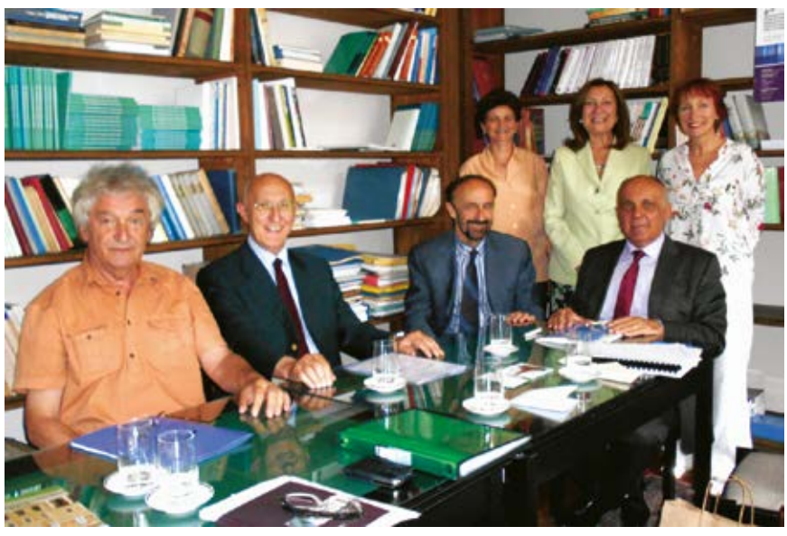
Museum Board, Academy Department of Medical Sciences, Zagreb, 2015.

geons; amulets, votives, talismans and notes; travel pharmacies from the 19<sup>th</sup> and the 20<sup>th</sup> centuries; photographs of lazarettos, quarantine hospitals,