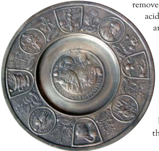
Saints Cosmas and Damian, plate with relief portraits, 19th century.

removed from the frames, coated in acid-free paper, and stored in the