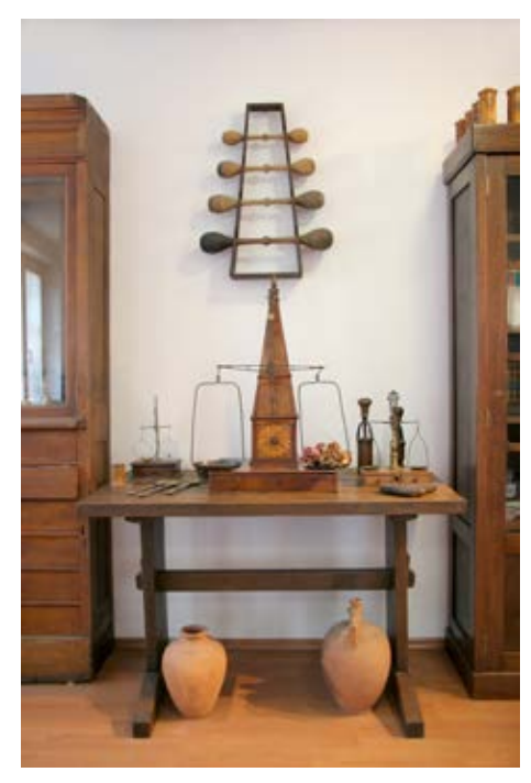
Old Pharmacy furniture with original containers for drugs from 18<sup>th</sup> and 19<sup>th</sup> century.

original manuscripts on the history of epidemics, disinfections, etc.; circular letters, orders and sanitary instructions related to combating infectious diseases and data on their prevention; photographs and posters related to public health, health awareness raising and hygiene: miniatures, portraits, reliefs and photographs of physicians and pharmacists; their dissertations, diplomas, rewards, etc.; pharmaceutical collections of stands, utensils and the accompanying archival materials; pharmaceutical utensils from early 20th centurv with original stands from the period 16th-20th ct.; utensils and art paintings related to the history of medicine and pharmacy; old and rare medical and phar-