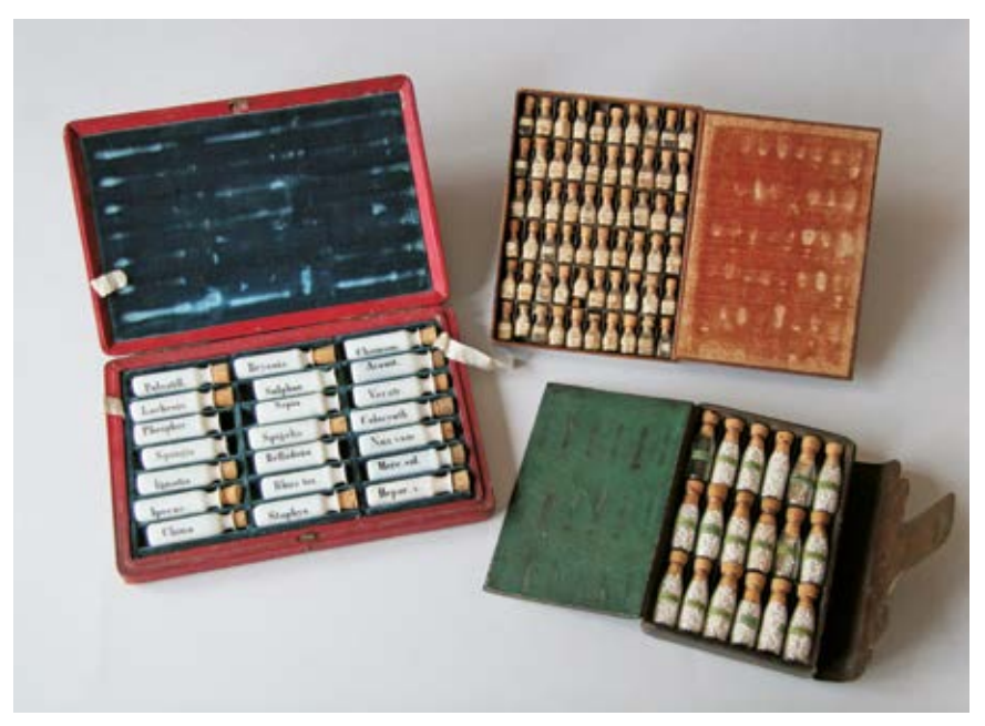
Sets of homeopathic drugs, 19th century.

safe, document, exhibit and publish Croatian medical and pharmaceutical heritage. In order to ensure the minimal preconditions for fulfilling these obligations, the initial operational tasks were carried out: office equipment acquirement (PC; printer/scanner/fax machine; digital camera); installation of the program for the processing of the museum material (M++); temporary storeroom equipment acquirement (archival cupboard for sensitive material, hygrometer and thermometer, metal combination shelves, archival cupboards). These acquirements were realised thanks to financial support rendered by the initial Museum donators.