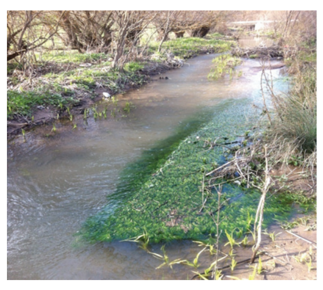
Fig. 2. Station 1 – Turuqicë stream in Turuqicë village.