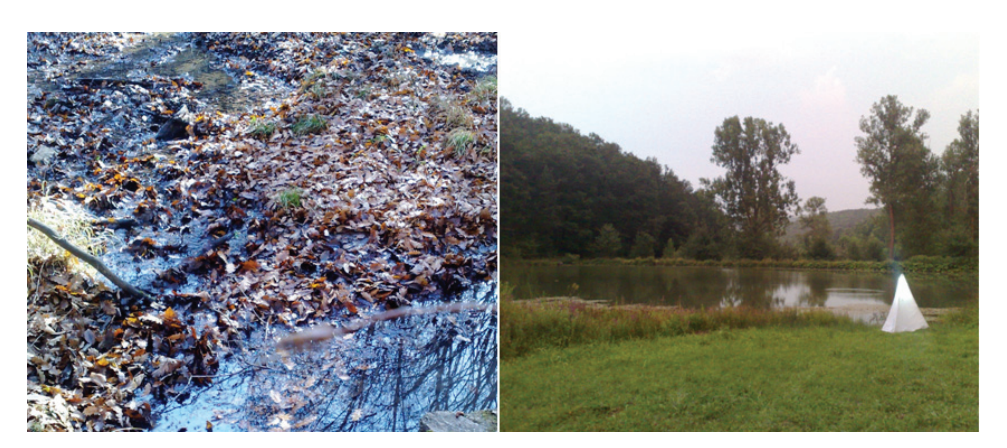
Fig. 3. Station 2 – Blinajë stream discharging into the first lake in Blinajë Hunting Reserve.

Specimens were determined by the first author. The collection is deposited at the Laboratory of Zoology of the Faculty of Natural and Mathematical Sciences, University of Prishtina, Kosovo.