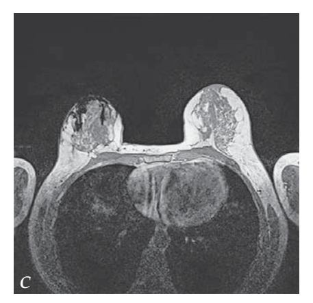
Fig 1. Artifacts on postoperative MR scan of the breast on subtraction sequence (A), dynamic sequence (B) and on T1-weighted image (C).

tion for the patient and medical staff, there is also a need for very precise interdepartmental cooperation with a nuclear medicine department which in practice, is sometimes difficult to obtain.