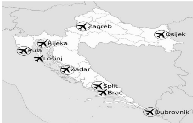
Figure 2: Seven international airports and two airfields in Croatia