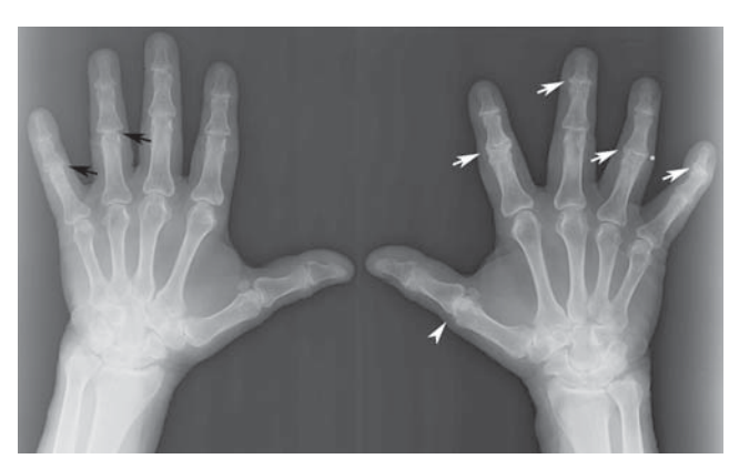
FIGURE 1 Conventional AP radiographs of the hands of an 85-year-old male patient with PsA. Note the narrowing of the interphalangeal joint spaces with osteophytosis and sclerosis – classic signs of osteoarthritic changes (white arrows). Fluffy bone appearance is seen at the site of active disease (asterisk). Erosion of the heads of the proximal phalanges results in the "pencil-in-cup" sign (black arrows). Subluxation of the first MCP joint can also be seen (white arrowhead). Typically of PsA, changes are asymmetric and seen in the distal joints.

SLIKA 1. Standardne rendgenske snimke obiju šaka 85-godišnjega muškog pacijenta sa PsA učinjene u AP projekciji. Vidljivo je suženje interfalangealnih zglobnih prostora s osteofitozom i sklerozacijom zglobnih tijela – tipični znakovi osteoartritičkih promjena (bijele strjelice). Kost na mjestu aktivne bolesti ima "čupav" izgled (zvjezdica). Erozija glava proksimalnih falangi dovodi do pojave znaka "olovke u šalici" (crne strjelice). Također je vidljiva subluksacija prvog MCP zgloba (bijeli vrh strjelice). Uobičajeno za PsA, promjene su asimetrične i zahvaćaju distalne zglobove.