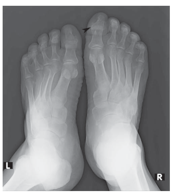
FIGURE 2 Conventional AP radiographs of the feet of an 85-year-old male patient with PsA. Erosion of the head of the proximal phalanx resulting in the "pencil-in-cup" sign is seen in the right big toe (black arrowhead). Some soft tissue swelling is also present.

Kavanaugh et al. recently published another paper (20) on evaluation of long-term outcomes in 395 PsA