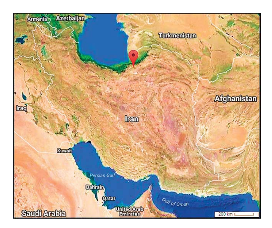
Fig 3: Location of the Tazareh coal mine