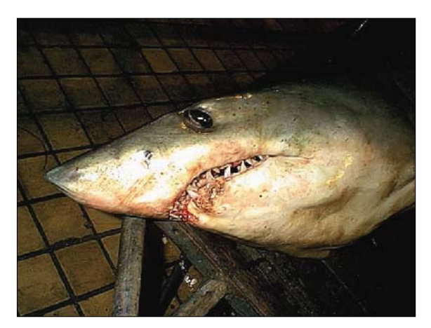
Fig. 2. Ventral surface of the head showing the snout and the mouth

The teeth in each jaw present a single pointed medial cusp slightly oblique towards the commissure of the mouth. The ridges of this