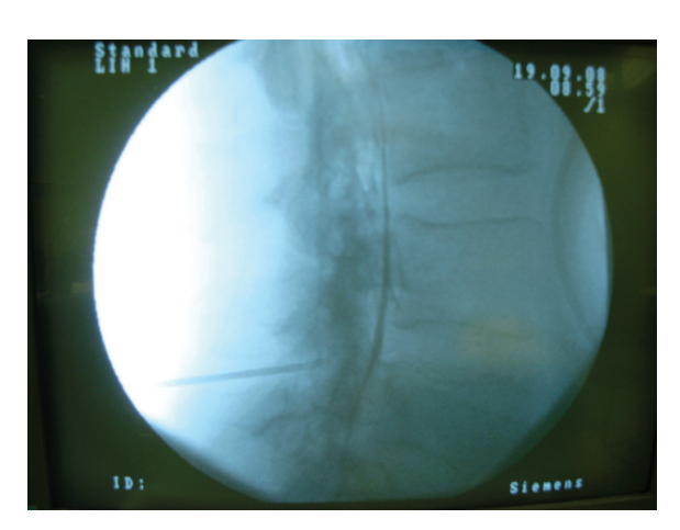
Figure 2. Lateral radiograph of the lumbar spine during interlaminar lumbar epidural injection (after the contrast injection).

Suspension of 80 mg depo-medrol with 10 ml 0.5% lidocain was injected with the interlaminar approach; and in comparison a suspension of 40 mg depo-medrola with 5 ml.0.5% lidocain was injected with the transforaminal approach. The patients received a series of up to three interlaminar or transforaminal lumbar epidural steroid injections, spaced 2–4 weeks apart. No anticon-