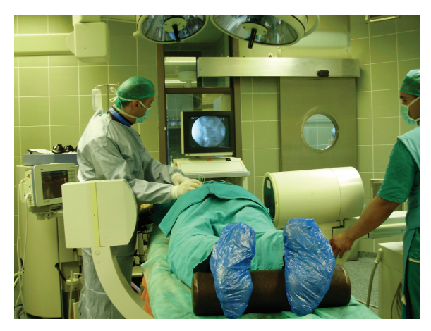
Figure 1. Position of the patients for interlaminar and transforaminal lumbar epidural steroid injection.

The research was approved by the Clinical Centre's Ethical Committee. In this longitudinally cohort controlled study, 50 patients were included by random choice, stratified according to their confirmed (by magnetic resonance imaging and electromyography) diagnosis of lumbar lateral spinal compression. The patients included had suffered from lumbar radicular pain for up to six months, with pain assessed as three or higher on the visual analogue scale. The visual analogue scale (VAS) is commonly used as the outcome measure for such studies. It is usually presented as a 10-cm horizontal line on