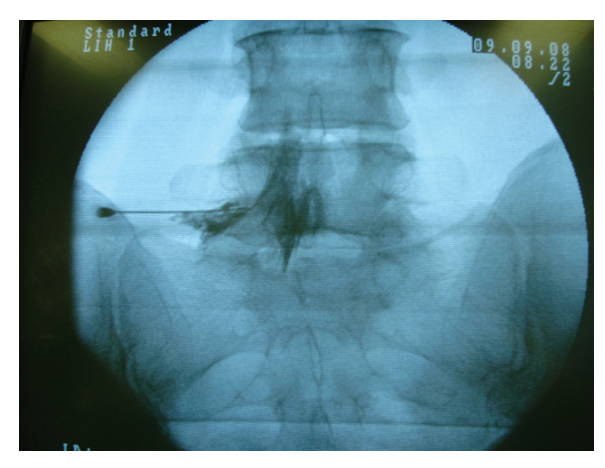
Figure 3. Anterior-Posterior radiograph of the lumbar spine following lumbar transforaminal injection (after the contrast injection).

vulsants or antidepressants were allowed during the period of the study. For breakthrough pain, patients were allowed to use tramadol, 1–2 tablets q 6 hours, as needed. The patients were advised to take additional analgesia if the pain exceeded 3 on the visual analogue scale. Patients were monitored and their pain assessed on the visual analogue scale at each visit and at visits three and six months following the first injection (using VAS scores).