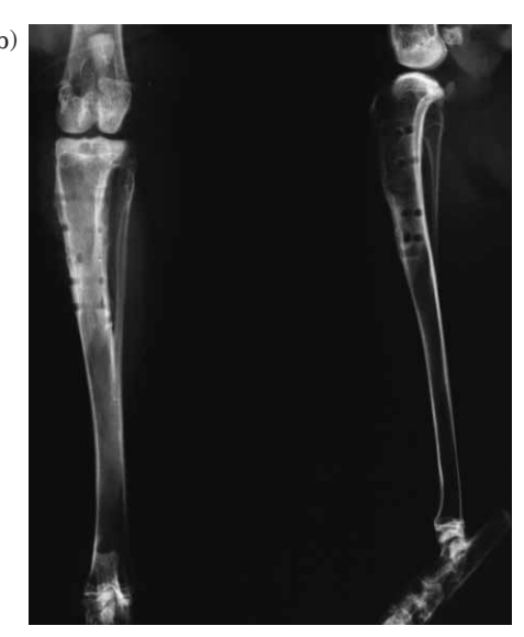
Fig. 3. Radiographic findings from the control (a) and experimental animals (a) 12 weeks after surgery.