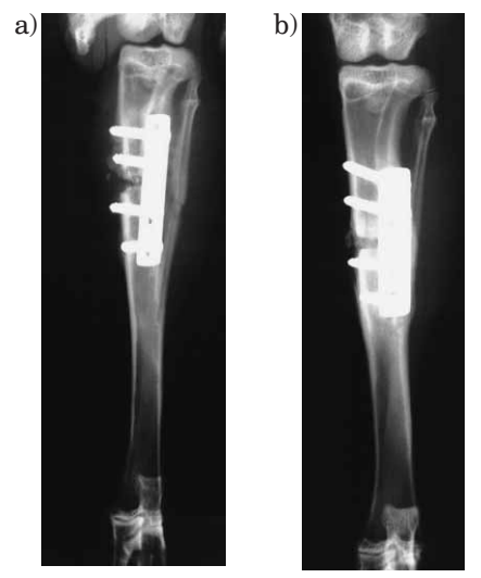
Fig. 1. Radiographic findings from the control (a) and experimental animals (b) 2 weeks after surgery.