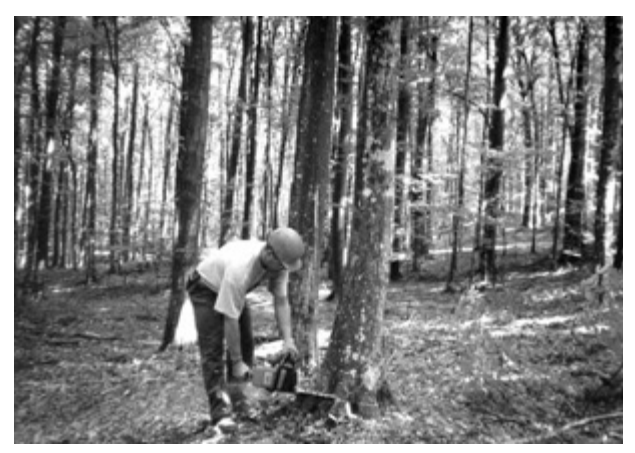
Figure 2 Cutter engaged in felling and processing Slika 2. Sjekač pri sječi i izradbi stabla