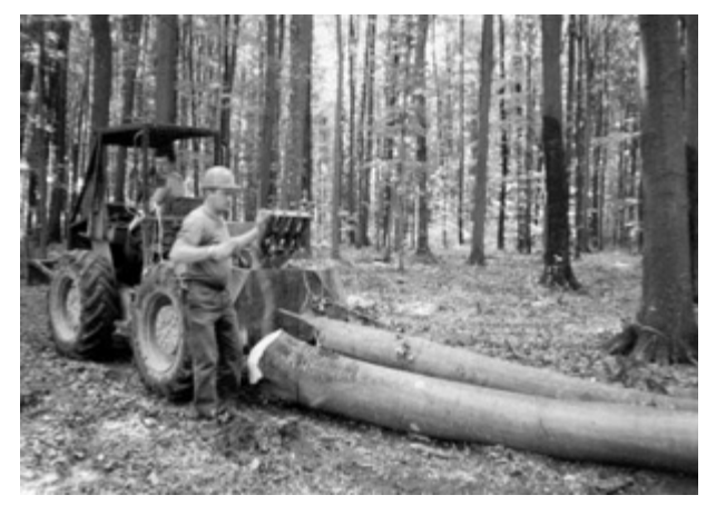
Figure 1 Cutter and tractor driver's work related to load hooking Slika 1. Sjekač i traktorista pri vezanju tovara

task of the work team is to achieve better connection and performance of all operations, starting with the preparation work and ending with the delivery of the forest assortments to the buyer. The basic characteristics of teamwork is a single work order determined on the basis of individual daily standard efficiencies of each member of the team. The daily standard efficiency is calculated and showed averagely per member of the team. The workers carry out the work at the same workplace with the same means and object of work (Fig. 1).