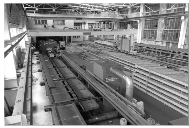
Figure 2. Installed new robotised profile cutting line

used for continuous process improvement, planning and control in every day production.