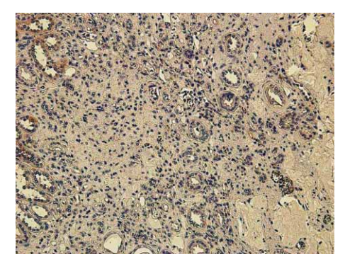
Fig. 2. Bone morphogenetic protein 7 expression in chronic pyelonephritis.