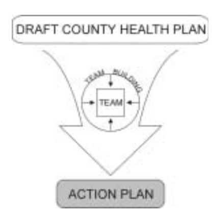
Fig. 4. Module 4. – Teams are developing policies and programs to address priority health issues, work on implementation plans, monitoring, quality assurance and evaluation.

A tutorial system of guidance and monitoring was introduced after the fourth workshop to ensure that team members not lose their commitment and enthusiasm. County team coordinators meet mentors monthly and follow-up workshops on county health policy development were held every three months (Motovun, July 2002, Krapinske Toplice, November, 2002, Jastrebarsko, February 2003, Zagreb, May 2003, Motovun, July 2003, Mljet, October 2003). Alumni from the first cohort were involved in training of second and third cohorts, providing new trainees with practical advices and guidance from recent graduates of the program. Expert help and support to the counties was provided by the faculty on request throughout the process of development of the County Health Plans.