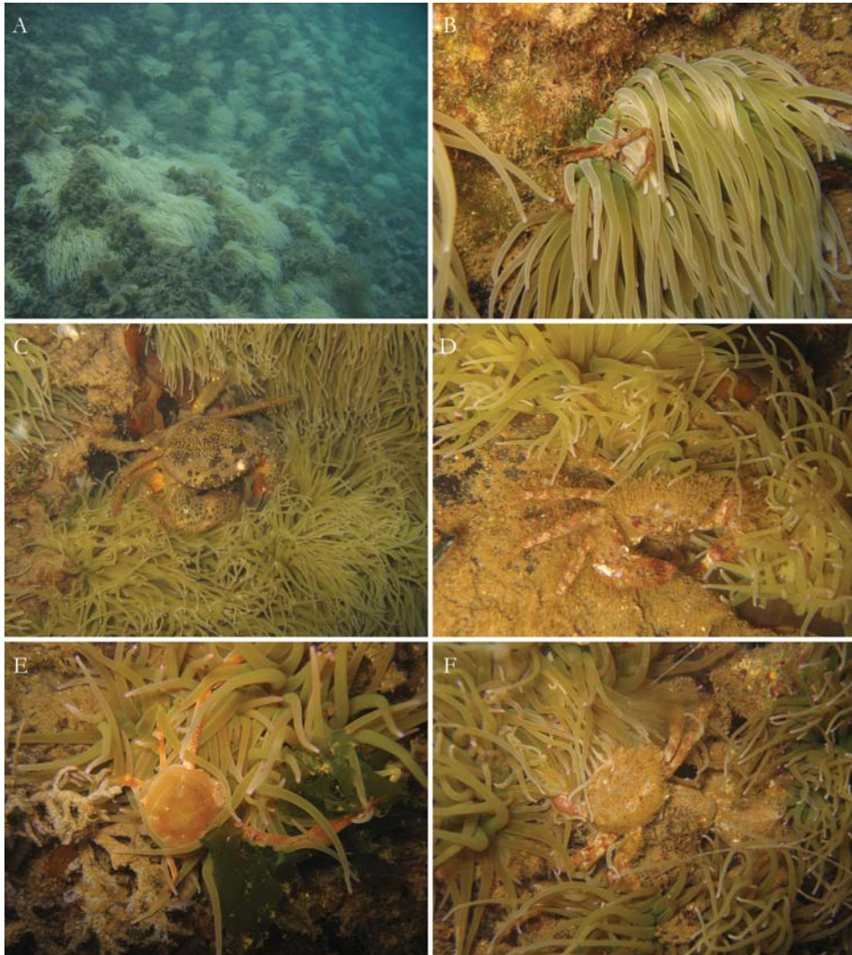
Fig. 1. A. Anemonia viridis meadow. B-D. Host-adapted decapods in their anemones. B. Inachus phalangium . C Eriphia verrucosa . D. Pilumnus villosissimus . E, F. Anemone-naïve decapods attacked after their introduction. E Ilia nucleus , a species never found associated with anemones in the studied bay, heavily attacked by Anemonia viridis after introduction; note tentacles glued onto crab at various parts of the body. F Anemone-naïve Pilumnus villosissimus , hence an individual belonging to a species that is facultatively symbiotic, after introduction in reverse gear seeking for its way out of the anemonias after attack; note numerous tentacles glued onto the anterior body part of the crab.

For the tested species not found on anemones in Saline Bay, it becomes clear that all of them lack pre-adaptation, as almost all the tested anemone-naïve individuals provoked a defence reaction. However, the number of individuals from most of the