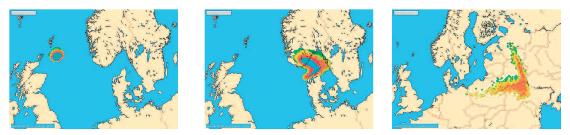
Figure 1. Total activity at the ground: 6 hrs (left), 18 hrs (middle) and 60 hrs (right) after explosion.