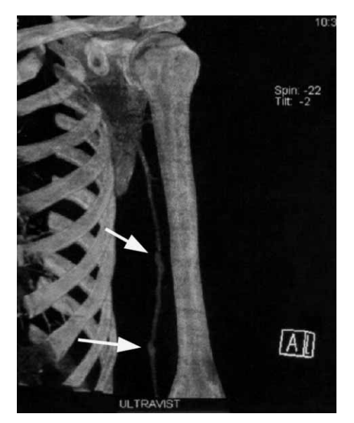
Fig. 1. CT Angiography of the left brachial artery five year after injury, A-L projection. Arrows are showing the places of anastomosis between proximal and distal parts of the left brachial artery with reversed interposition saphenous vein graft.

loon catheter was passed to remove any thrombotic or embolic material in the remaining artery. After back bleeding from artery, distal and proximal edges were flushed with 0.1% heparin solution to prevent fresh thrombosis formation. Systemic heparin anticoagulation was administered intravenously before the vessels were occluded proximally and distally with non-traumatic vascular clamps. We took a reverse autologous saphenous vein interposition graft approximately 12 cm long with a