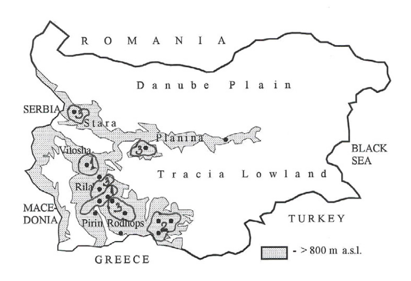
Figure 1. Location of meteorological stations used in the study along with the major snow cover groupings identified by the PC analysis.