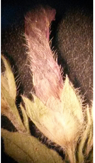
Figure 3. Convolvulus sabatius subsp. mauritanicus: prominent protruding hairs on the stem, leaves, calyx and corolla.