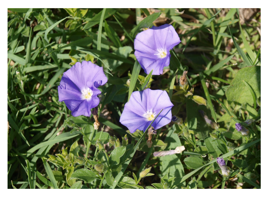
Figure 2. Convolvulus sabatius subsp. mauritanicus on the meadow in the settlement Rudine of Kaštel Novi (Photo by D. Vladović).

Convolvulus sabatius in Croatia D. Hruševar et al.